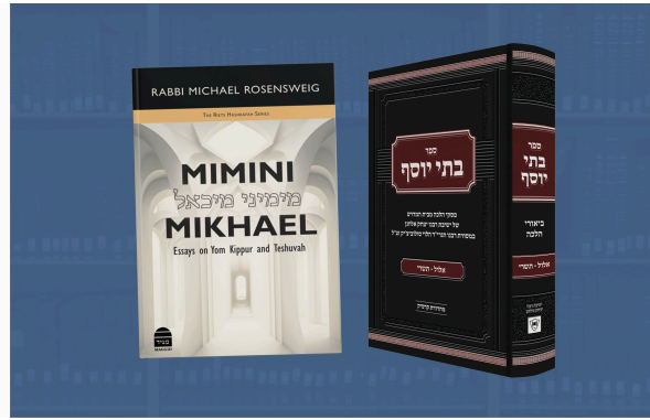
RIETS Releases Two New Books specifically geared towards providing insights on the High Holy Days.