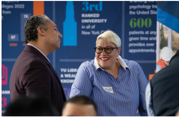
The Innovation Lab is assisting seven local Washington Heights businesses with pro bono business consulting services.