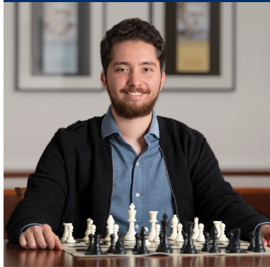
Semyon Lomasov : Chess Grandmaster and winner of 2023 Summer Chess Classic