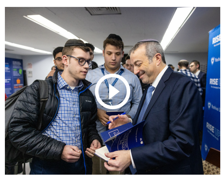
Click on the image above or <u>here</u> to watch the clip.

In my mind, our education at Yeshiva University uniquely prepares one for this final exam. And that's why I wrote this book. Sometimes as students we are so focused on the grade and the task ahead that we lose sight of our real goals and purpose. For you our students and for all members of our community who are seeking to continue growing in your life journey, I hope this book helps spark your thinking about your potential to lead lives of meaning, service and contribution.