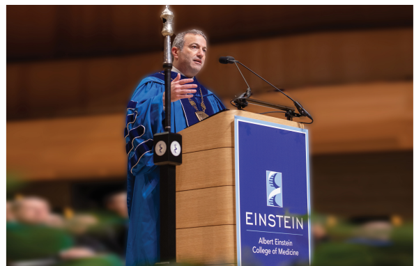
Einstein's Commencement at Lincoln Center, May 24 (right)