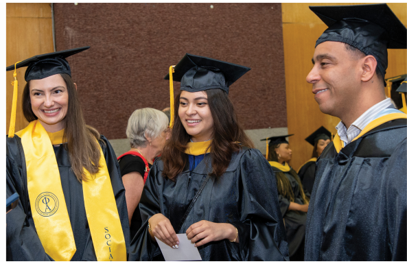
Wurzweiler's Commencement , May 16 (right)