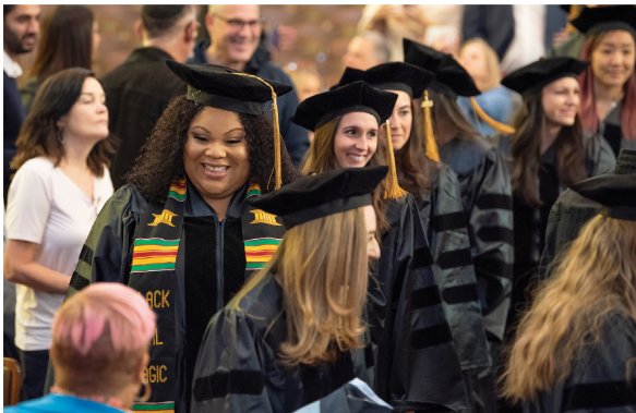
Ferkauf's Commencement , May 18 (left)