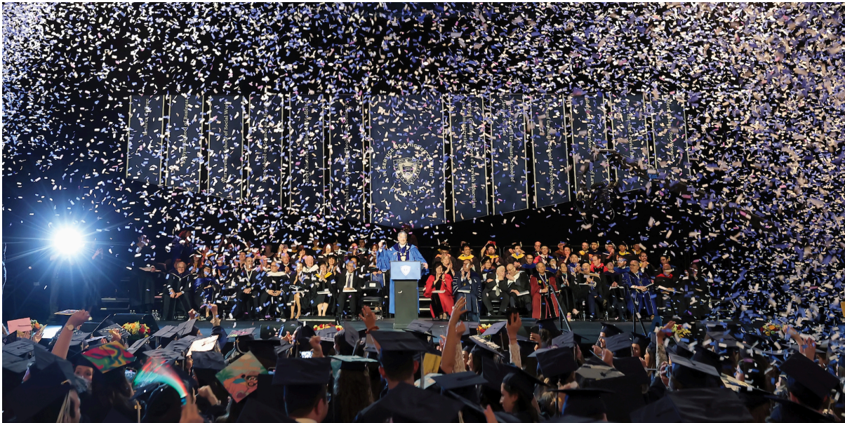
Commencement at Madison Square Garden on May 23 brought together more than 5,000 students, friends and relatives. For a gallery of images, click here