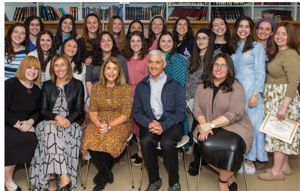
GPATS Graduation , May 17 (right)