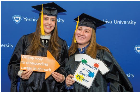
Azrieli's Commencement , May 10 (left)