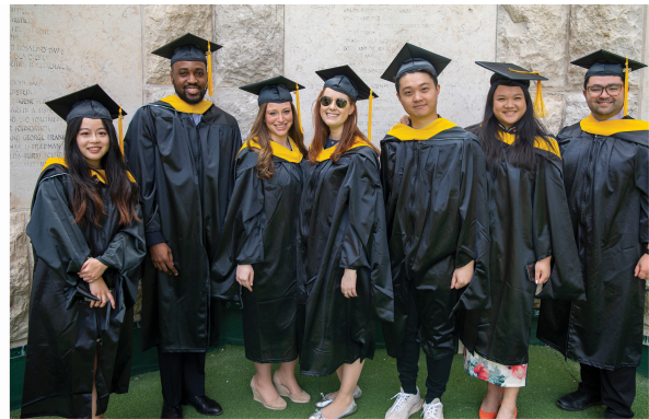
The Katz School Commencement , May 15 (right)