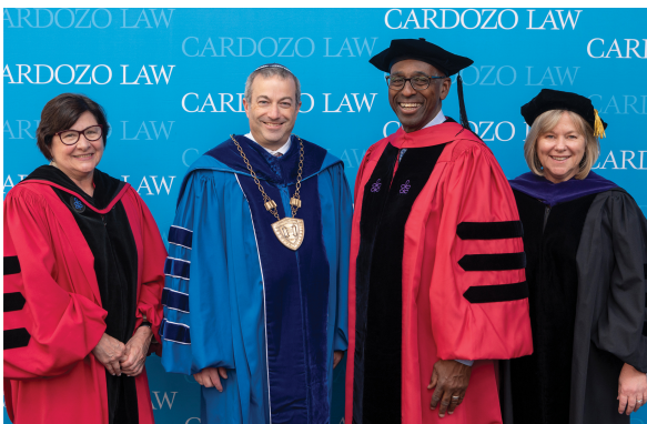
Cardozo's Commencement at Lincoln Center, June 5 (left)