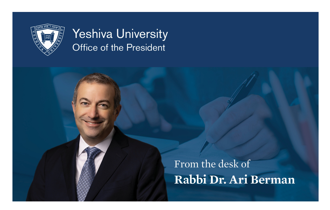
My Dear Friends,

As I left Gaza last month from my <u>visit with the soldiers</u>, I felt that a part of me stayed behind. It was a terrifying experience being in a war zone. Yet I was leaving while our sons and daughters in the IDF remained. Even more heartbreaking was that we still have over 100 brothers and sisters in captivity. One cannot imagine the terror of their daily experiences. Today though we do not need to imagine, for some of the released hostages have shared stories of their time in Gaza. From them we hear very clearly that our worst nightmares are being realized: hunger, <u>lack of medical supplies</u> and <u>sexual abuse</u>.