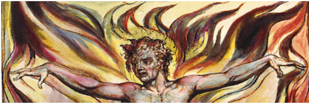
William Blake, America a Prophecy (1793, 1821)

This course examines works by famous British Romantic authors—Blake, Wordsworth, Coleridge, Byron, Keats, the Shelleys, and Austen—through the lens of revolution. Part of the “Age of Revolution,” this period (roughly 1780–1830) is marked by political upheavals in America, England, France, and elsewhere; by demands for the rights of man and woman; and by calls for the abolition of the slave trade. Due to developments in anthropology, astronomy, biology, chemistry, geology, medicine, meteorology, and physics, this was also the age of the “Second Scientific Revolution,” which in turn contributed to the rapid economic expansion and technological advances of the Industrial Revolution and its shift from agriculture in the country to manufacturing in the cities. We will explore how these key historical and cultural frameworks—what was called at the time “the spirit of the age”—informed some of the greatest literature of the period, including Songs of Innocence and Experience , Lyrical Ballads , The Prelude , Frankenstein , and Emma .